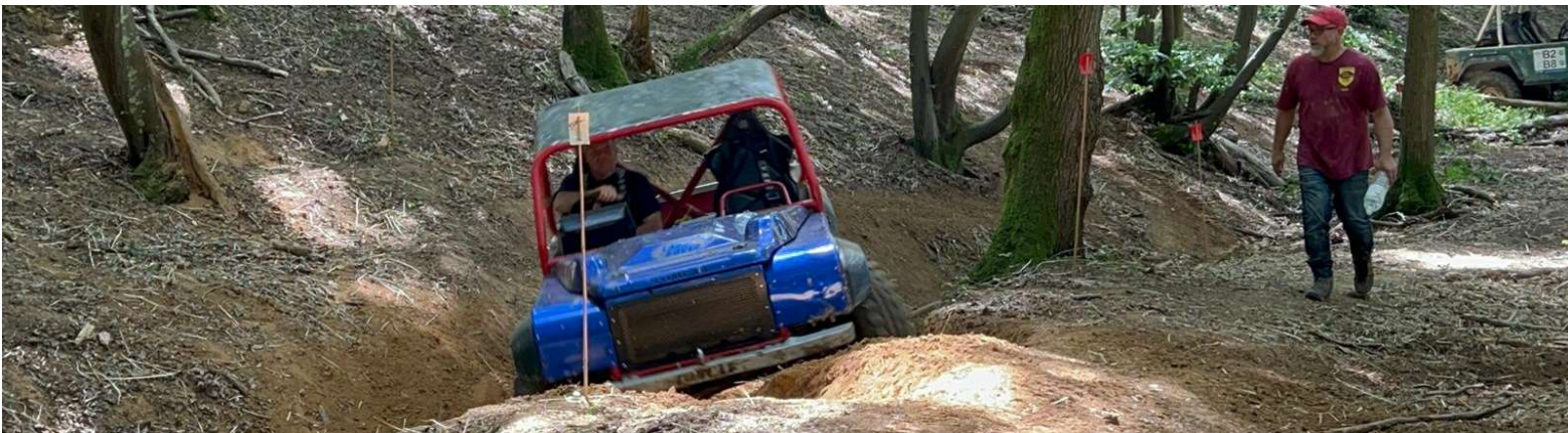
3 rd OVERALL