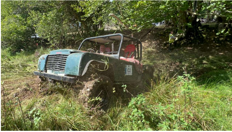
Dave Powell's 1 st attempt to splash me (FAILED)