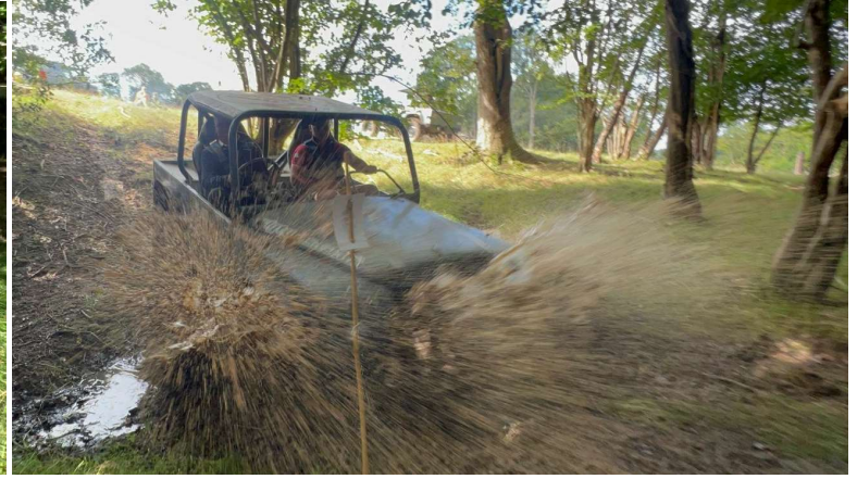
Harry Powell's 1 st attempt to splash me (SUCCESS)

The drivers were on the ball. Walking sections quickly and efficiently and always ready on the line when needed. The first 4 sections were uneventful with just 1 recovery needed to remove an 80 from a fallen tree that it had mounted. Section 5 however saw a number of recoveries from the 3 gate with a bogie run up the stream and a step up at the end. Not only was this the scene of multiple recoveries, but also where Dave Powell's 2 nd attempt at splashing me succeeded. Not photographic evidence I am embarrassed to report. But, Dave knows he is on the list!!! I'll get you Dave!!